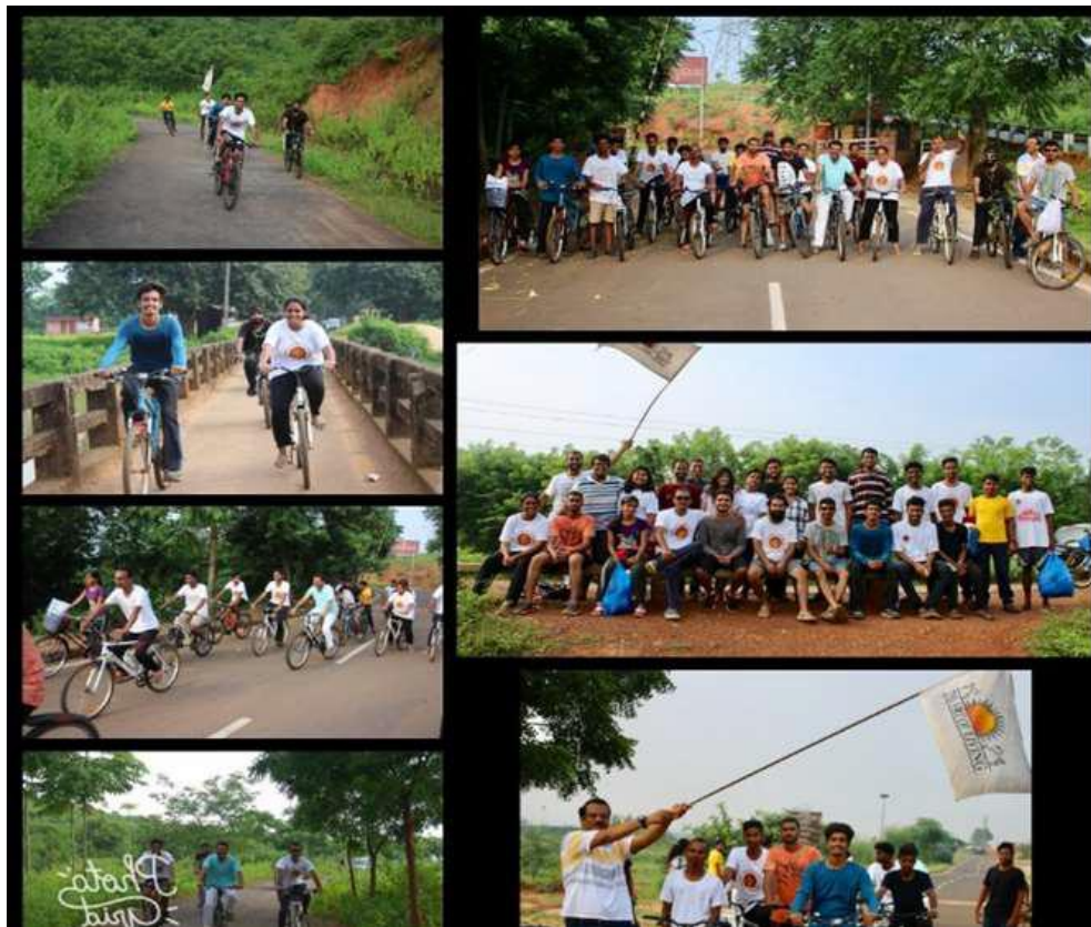
Promotion of cycling on campus

To encourage cycling activity on the campus, every week there is a cycling rally held where all the students and faculty staying on the campus participate.