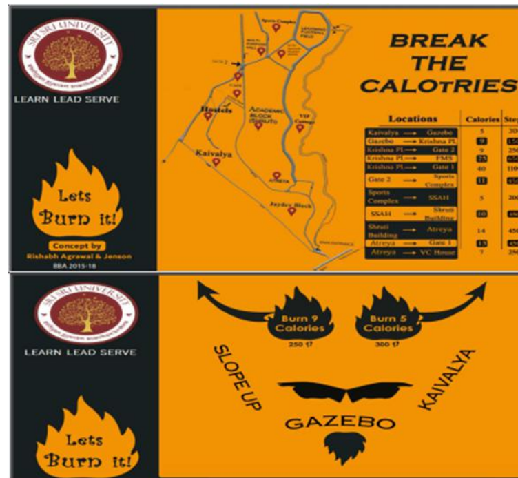
Walking signage at different locations in University

In Sri Sri University, sustainable practices are adopted for commuting of students and faculties. On campus, walking is encouraged to improve physical and mental health. For sustainable walking signage at different locations are placed that mention number of steps from one point to another and amount of calories burnt and this inspires one to walk. The provision of bicycles for the in-house students and security guards is available on the campus. The Electric vehicles are encouraged to be used on campus for the staff and students. The provision of buses for the students and staff staying outside the campus in Bhubaneswar and Cuttack cities is encouraged as a step towards sustainable commuting.