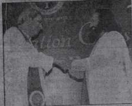
Chief minister Naveen Patnaik with Sri Sri Ravi Shankar at first convocation of Sri Sri University in Bhubaneswar on Wednesday

Speaking on the occasion, founder of the varsity Sri Sri Ravi Shankar said, "People of this state and country look towards you to lead both by ethics and business and create wealth. It's your job to create employment in the country, so do not give up on your dreams of becoming an entrepreneur."