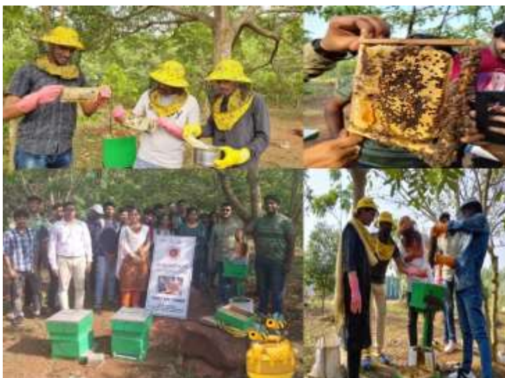
Plate 1. Workshop On Beekeeping