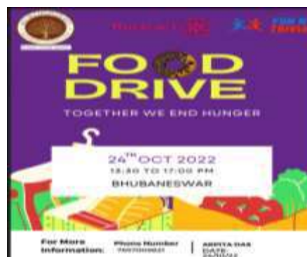
Plate 1. The student of the Rotaract Club, Sri Sri University organized a Food donation drive on 24th Oct 2022 in Bhubaneswar.