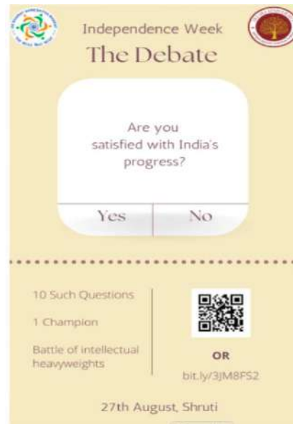
Plate 2. Celebrate the Independence