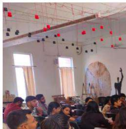
Plate 4. "Heritage of Odisha" on the occasion of 'World Day for Audiovisual Heritage'