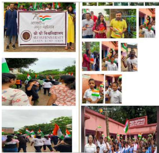
Plate 3. "Prabhat Pheris"