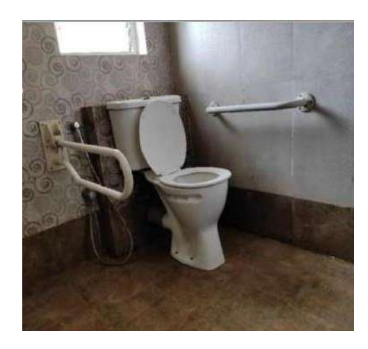
Plate 5. Wheel chair for person with disability Plate 6. Toilet specific to the person with disability