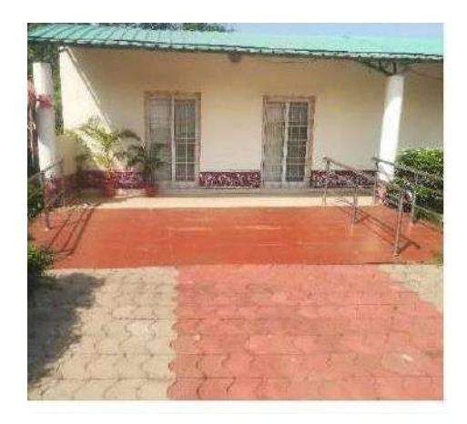
Plate 1. Lift in the multi-storey Academic Block Plate 2. Ramp to Administrative Block