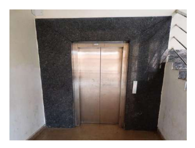
10.6.7 Accessible facilities Provide accessible facilities for people with disabilities