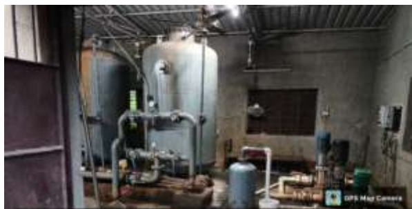
Water treatment systems