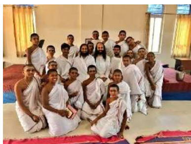
Plate - 1