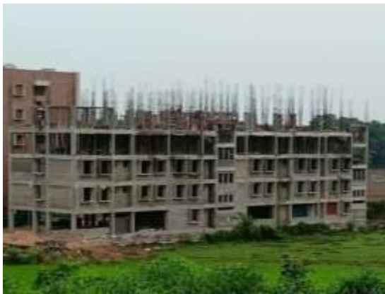
Fig. 6. Construction with fly ash bricks

Sri Sri University has a clear policy, resolution, and commitment to prioritize degraded and abandoned land for activities such as building construction, playgrounds, and more, in order to conserve local biodiversity. Additionally, the university promotes the use of green technology and eco-friendly materials for its infrastructure facilities, construction materials, and renovation projects.