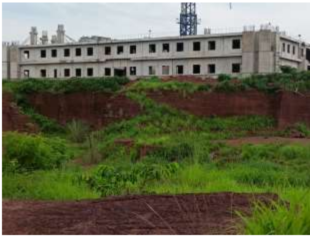
Fig. 5. Construction work by using the quarry site

been used for the development of playgrounds and construction of buildings so that additional acquisition of the land can be avoided or minimized for the protection of biodiversity ( Fig. 5 ).