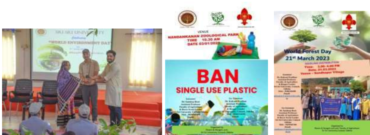
(a) (b) (c) Fig. 7. Outreach and awareness related activities of Sri Sri University: (a) World Environment day, (b) awareness activities on ban on single use plastic and (c) celebration of World forest day

The faculty and students of the Faculty of Agriculture regularly participate in outreach activities by providing training on organic farming, distributing organic fertilizers, distributing seedlings, and sharing knowledge with the community.