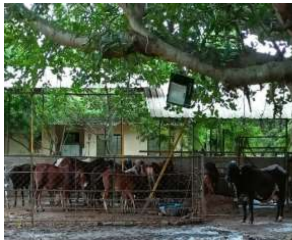
Fig. 2. Cow farm in the university campus

Different departments and clubs at Sri Sri University extend their educational outreach programs related to the sustainable management of land for agriculture. The university preferably organizes such programs in the adjoining villages. These programs include plantation in shared ecosystems, quiz competitions, poster-making competitions, and guest lectures. Students from both Sri Sri University and other institutions enthusiastically participate in these events ( Fig. 4 ).