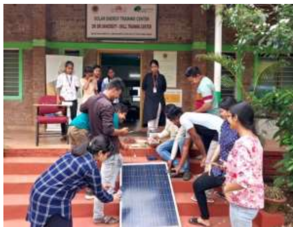
Fig. 3. Solar PV installer raining