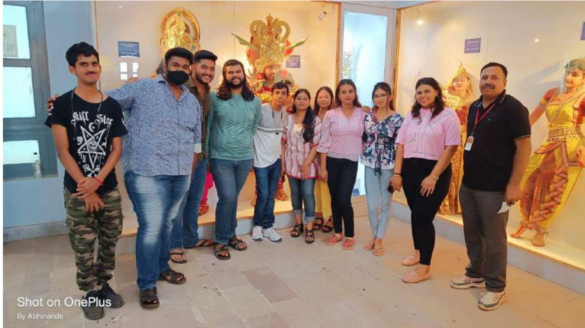
Plate 4. Students visiting the Maritime Museum at Cuttack, Odisha