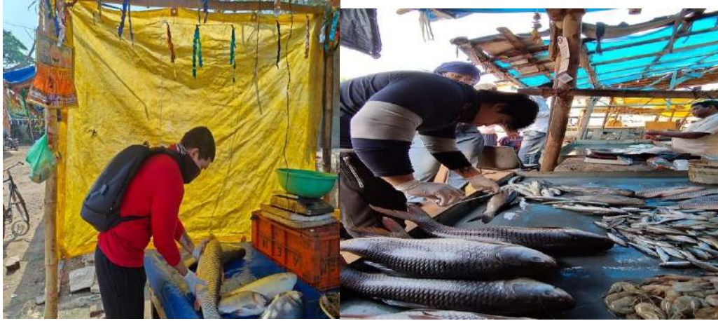
Plate 8. Students are interacting and collecting samples of fish from the local; fish market