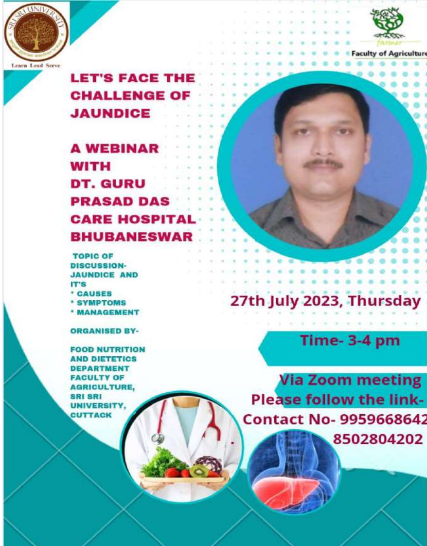
Plate 3. Educational program on water borne disease