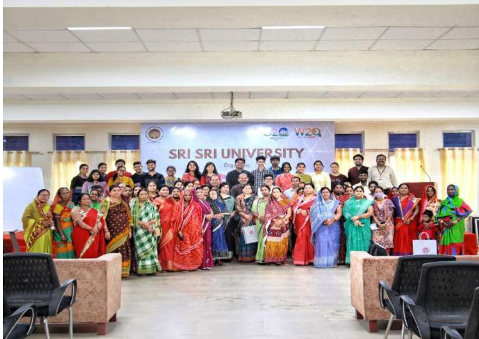
Plate 21. Local village women made aware of climate change, water usage, and agriculture.