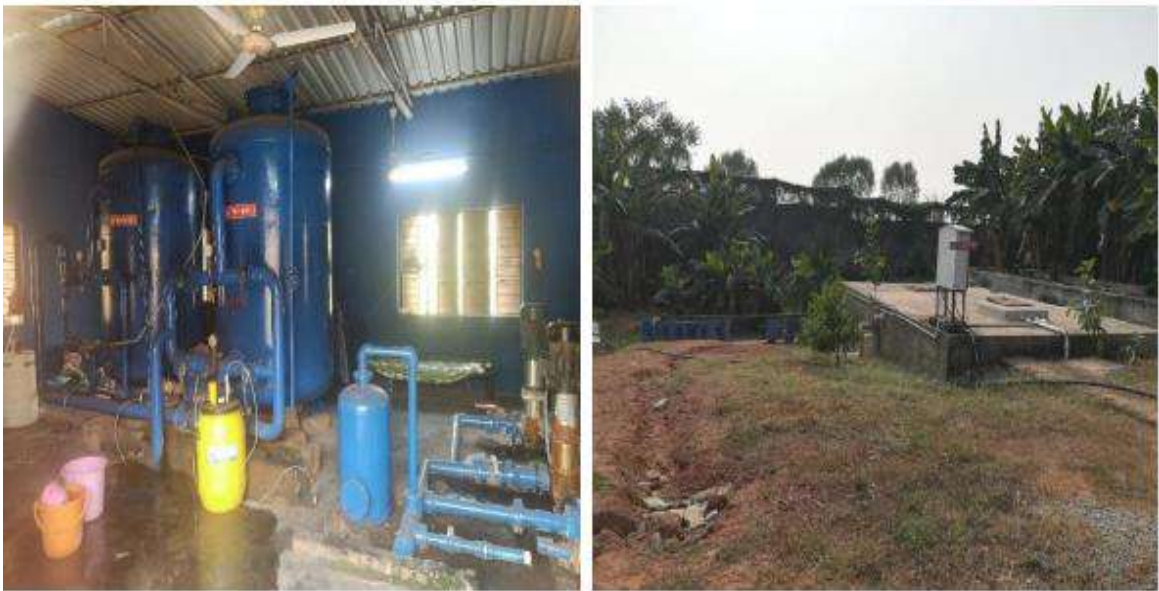
Plate 16,17 &18. Adjacent wetland and water treatment infrastructure at Sri Sri University