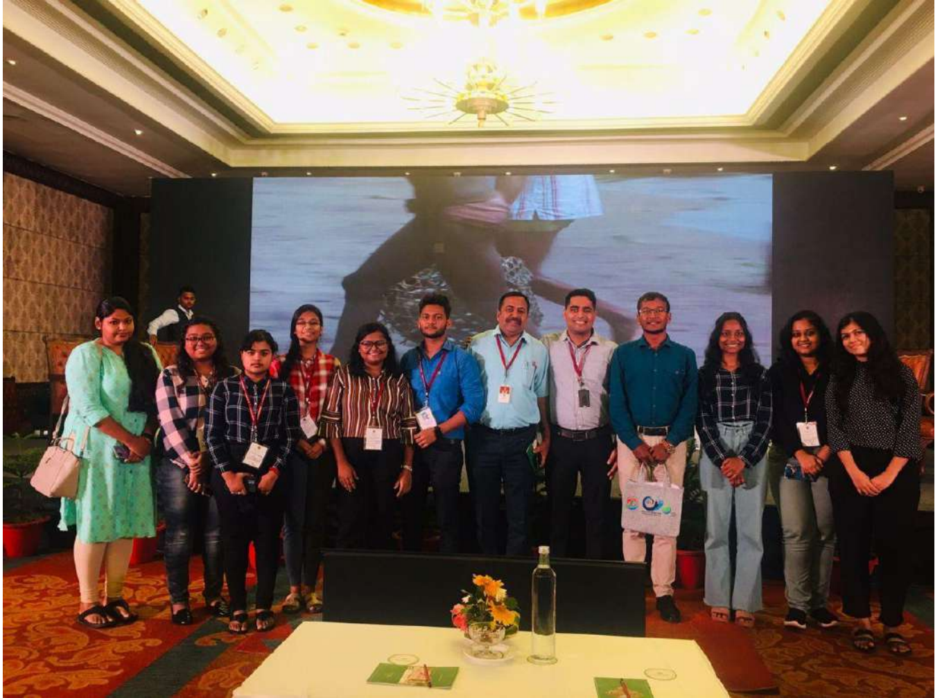
Plate 7. Students are participating in National Conference on Sustainable Coastal Management in Bhubaneshwar, Odisha organized by UNEP.