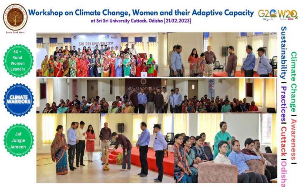
Plate 1. Community outreach prom with W20-G20

Research scholars are empowered to conduct studies on best water management practices, and the university actively disseminates state-of-the-art technologies, government policies, and subsidies for irrigation practices to local farmers and stakeholders. These initiatives have yielded tangible benefits, prompting notable changes in their actions and practices. These transformative outcomes underscore the impactful synergy between academic learning and real-world application at Sri Sri University, fostering a community dedicated to positive change in water and environmental management.