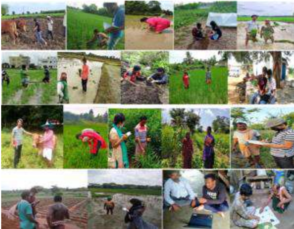
Plate 9. Students involved in various activities related to aquaculture, agriculture at Sri Sri University