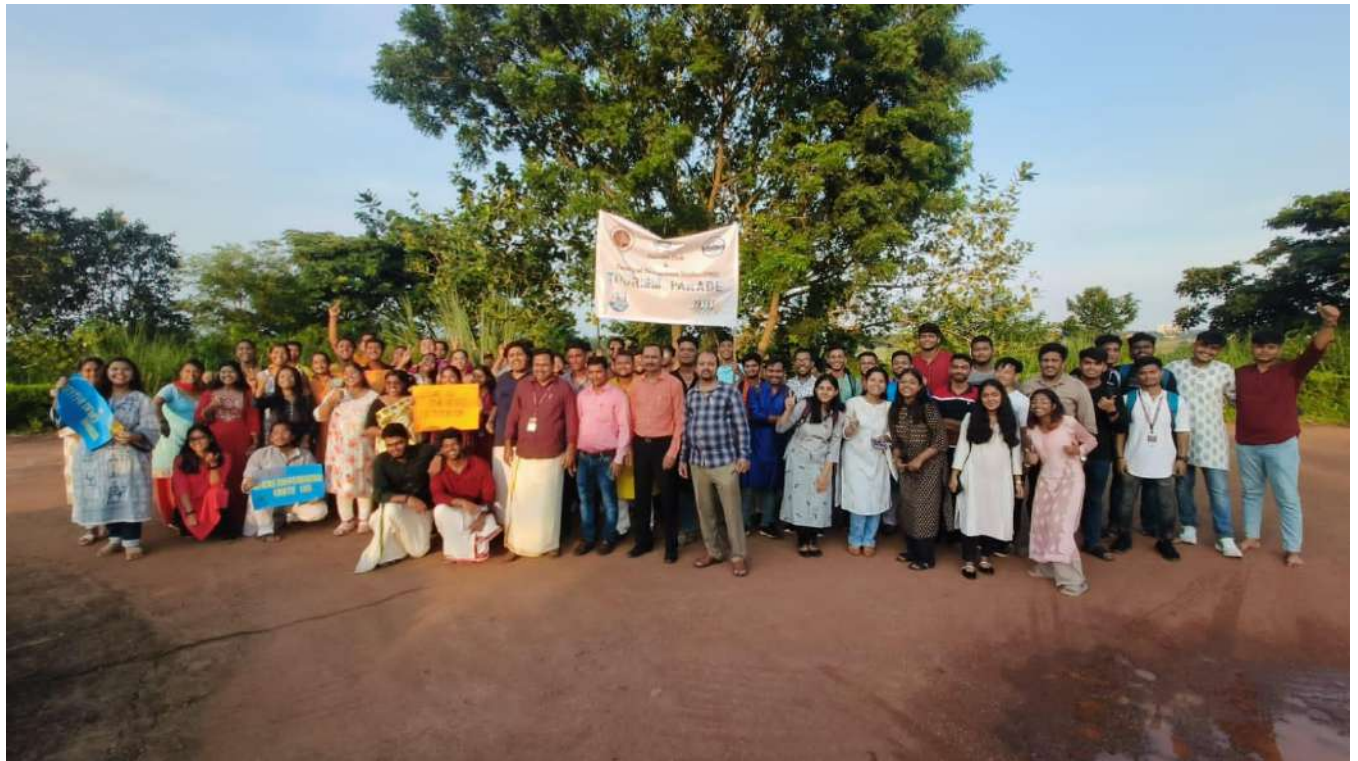
Plate 5. Students are participating in community outreach at Cuttack, Odisha