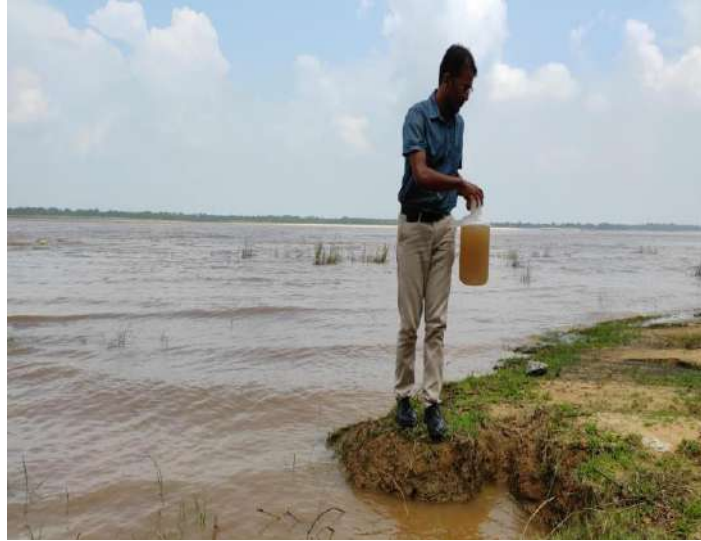
Plate 19. Student collect samples from the canal for water quality analysis.