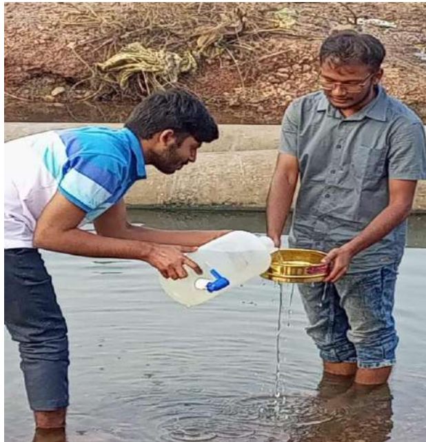
Plate 20. Students collecting samples from the canal for water quality analysis