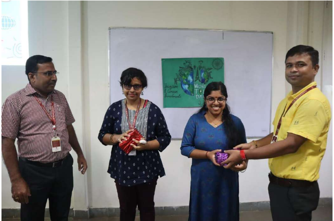
Plate 6. Students participating in Quiz competition on the occasion of World Tourism Day, 2023