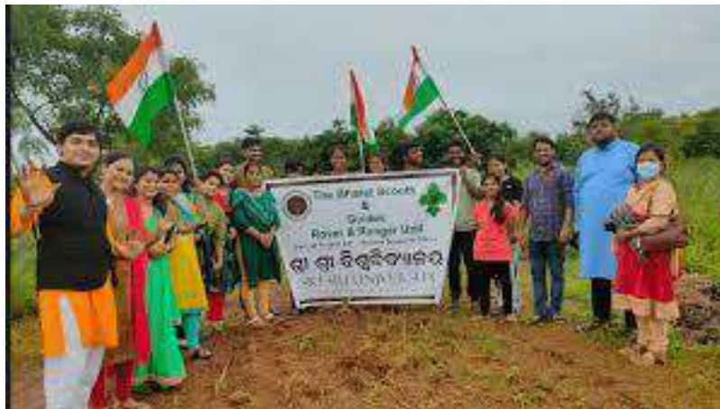
Plate 22. Plantation ion nearby villages by Sri Sri University students