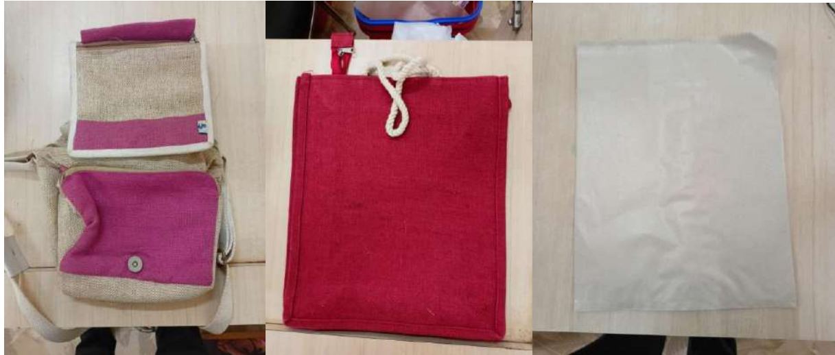
Plate 13,14 &15. Alternate materials of plastic like Jute Bags and paper bags are used inside the campus.