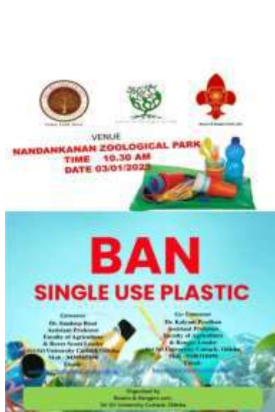
Plate 1. Awareness programme

Offer educational programme/outreach for local or national communities on sustainable management of land for agriculture and tourism