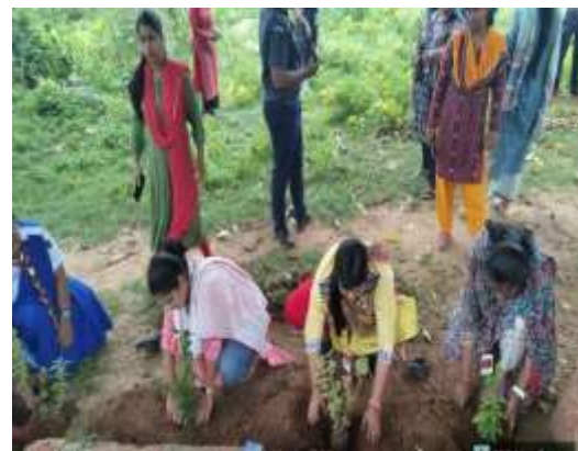
Plate 5. Tree plantation in Sandhapur