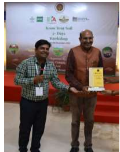
Plate 3. Soil judging competition