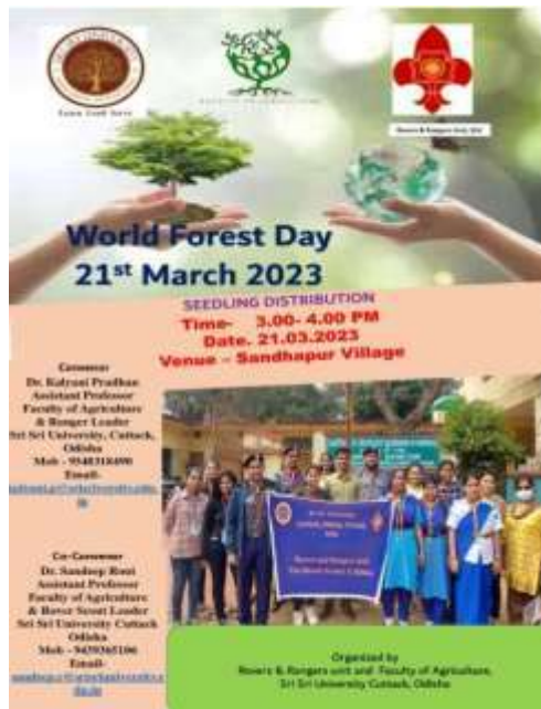
Plate 4. Seedling distribution