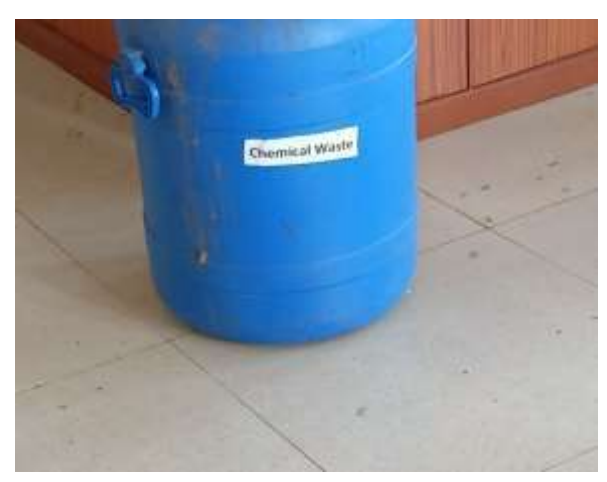
Plate 2. Container used to discard acid waste