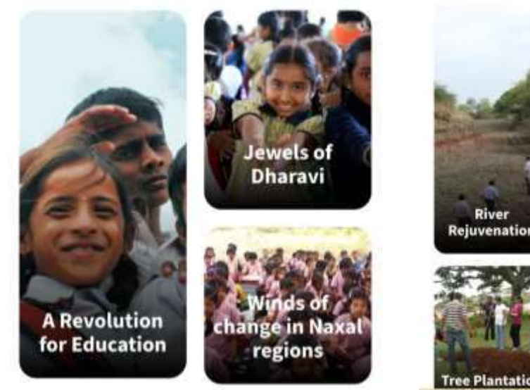
Plate 1. Educational activities

Collaborate with NGOs to tackle the SDGs through: student volunteering programmes, research programmes, or development of educational resources