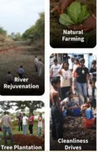
Plate 2. Environmental care