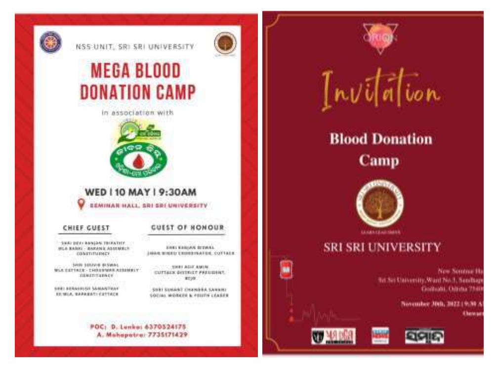
Plate 5. Blood donation camps in association with NGO organized by NSS and ORION, Sri Sri University