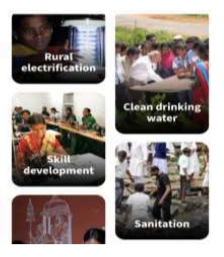
Plate 4. Rural development