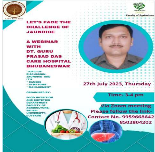
Plate 28. Jaundice awareness webinar