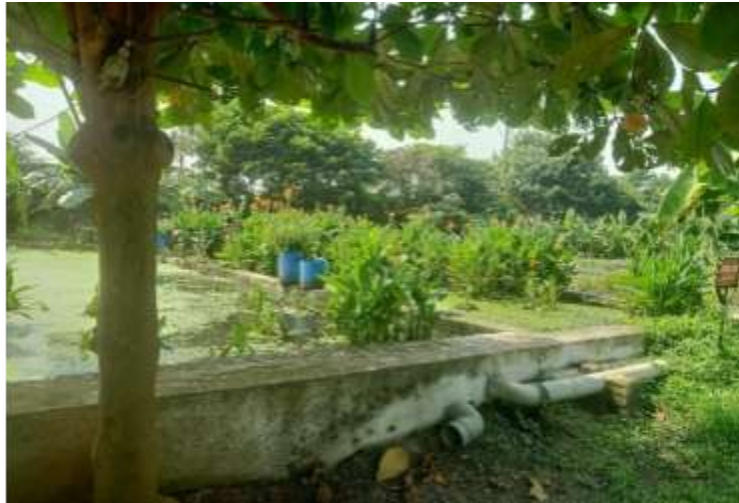
Plate 7. Biological Sewage Treatment Plant (Bio-STP) installed in SSU