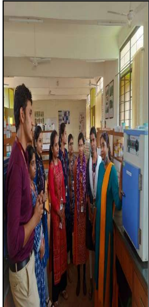
Plate 31. State of the Art Lab in SSU