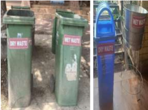
Plate 8. Segregation of waste at SSU