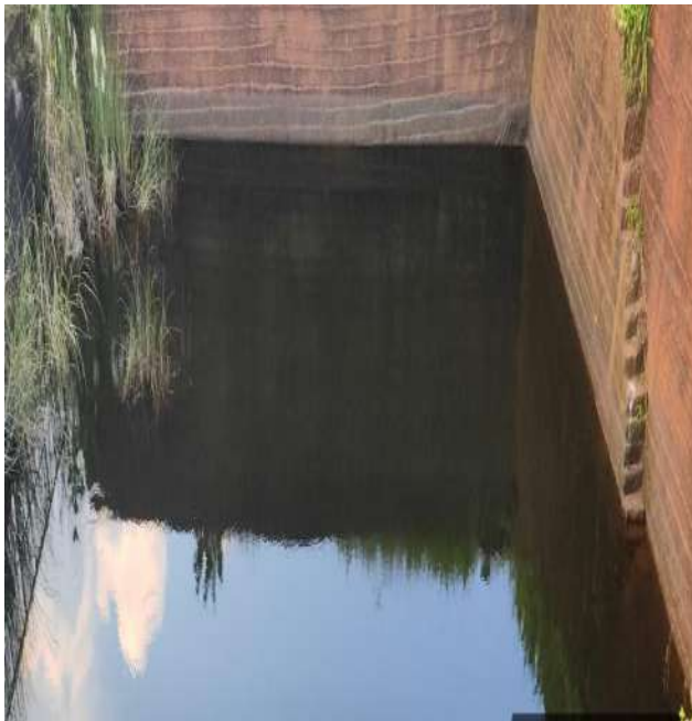
Plate 1. Quarry in SSU

The average water consumption per day in Sri Sri University is 650 m 3 with a campus population of 3,850. Thus, the average water consumption per person per day is only 0.168 m 3 . Total water consumption during this year has increased over the past year. This is attributed to water consumed by laborers/daily wages workers engaged in the construction of 14 storied Iconic tower and few new hostels in the campus.