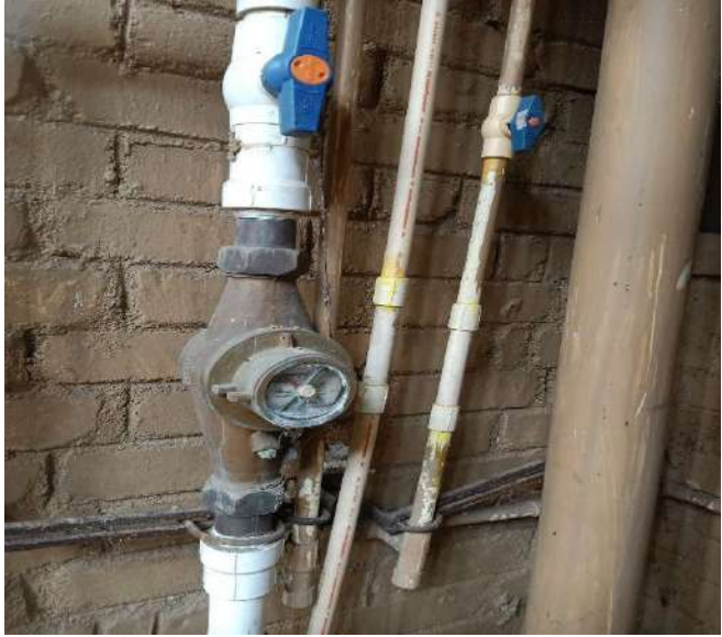
Plate 3. Water meters to track consumption