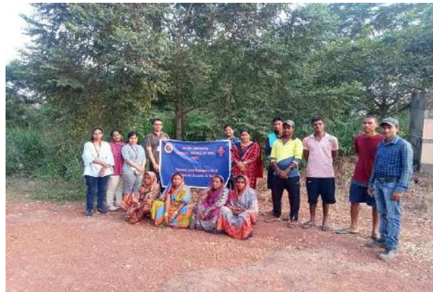
Plate 22. Rural awareness program for agriculture workers and labourers by SSU