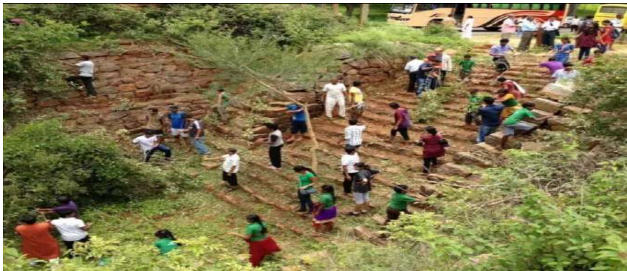
Plate 15. River rejuvenation by AoL