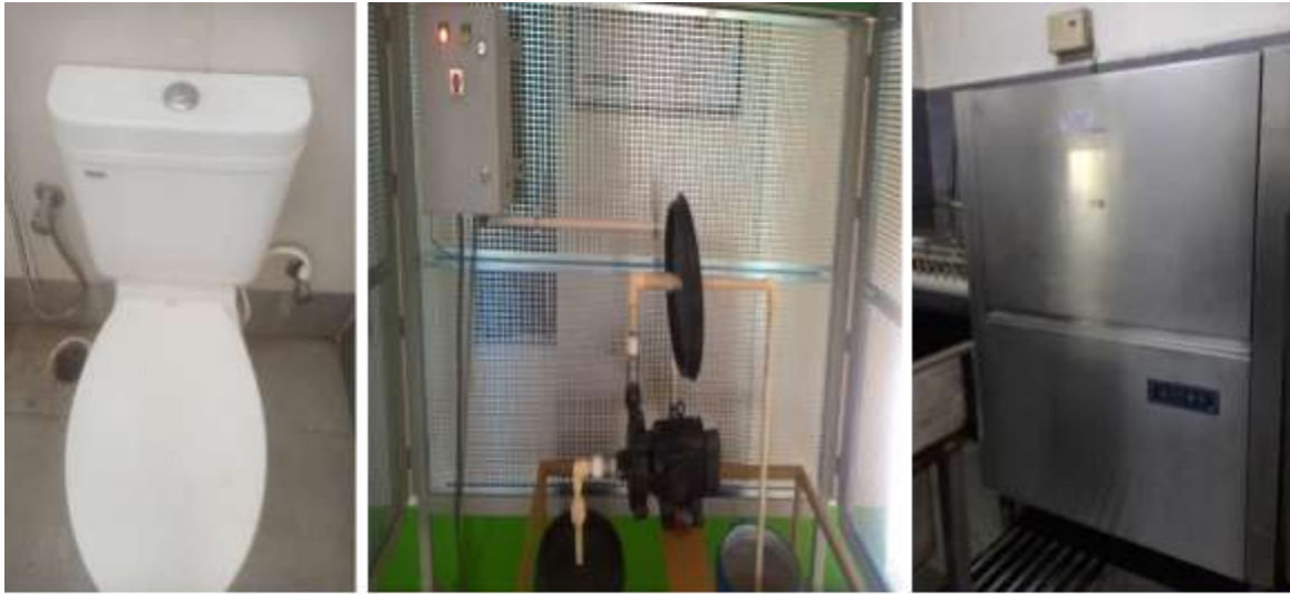
Plate 11. Drinking water quality in SSU