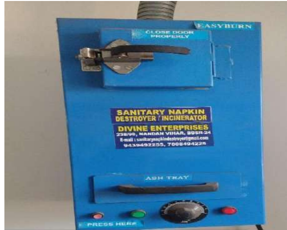
Plate 9. Sanitary napkin incinerator