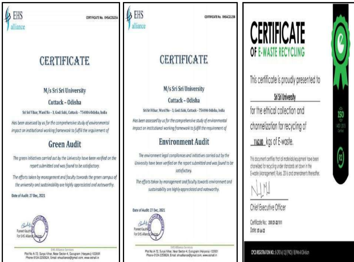
Plate 17. Awards and certificates to SSU for environment and sustainability