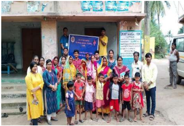
Plate 23. Rural awareness program by SSU