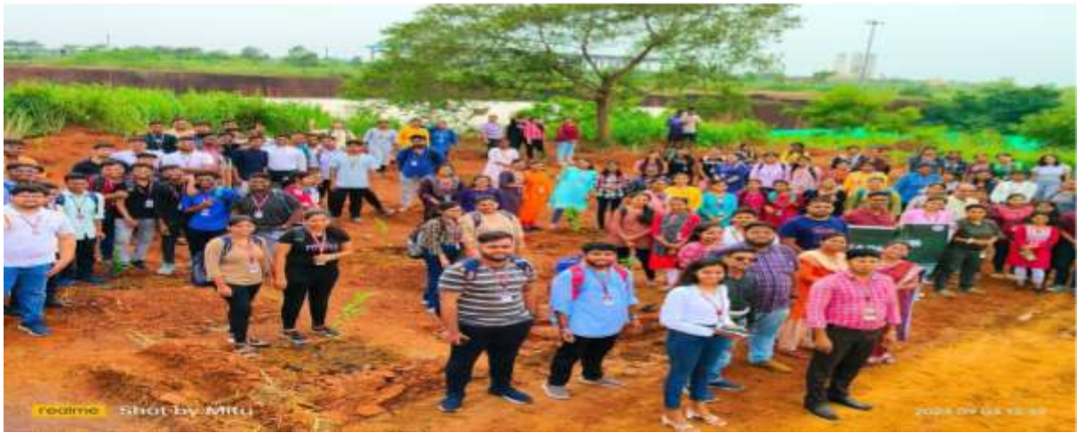
Plate 14. Awareness tours/program/extempore speech, cleanliness drive by students