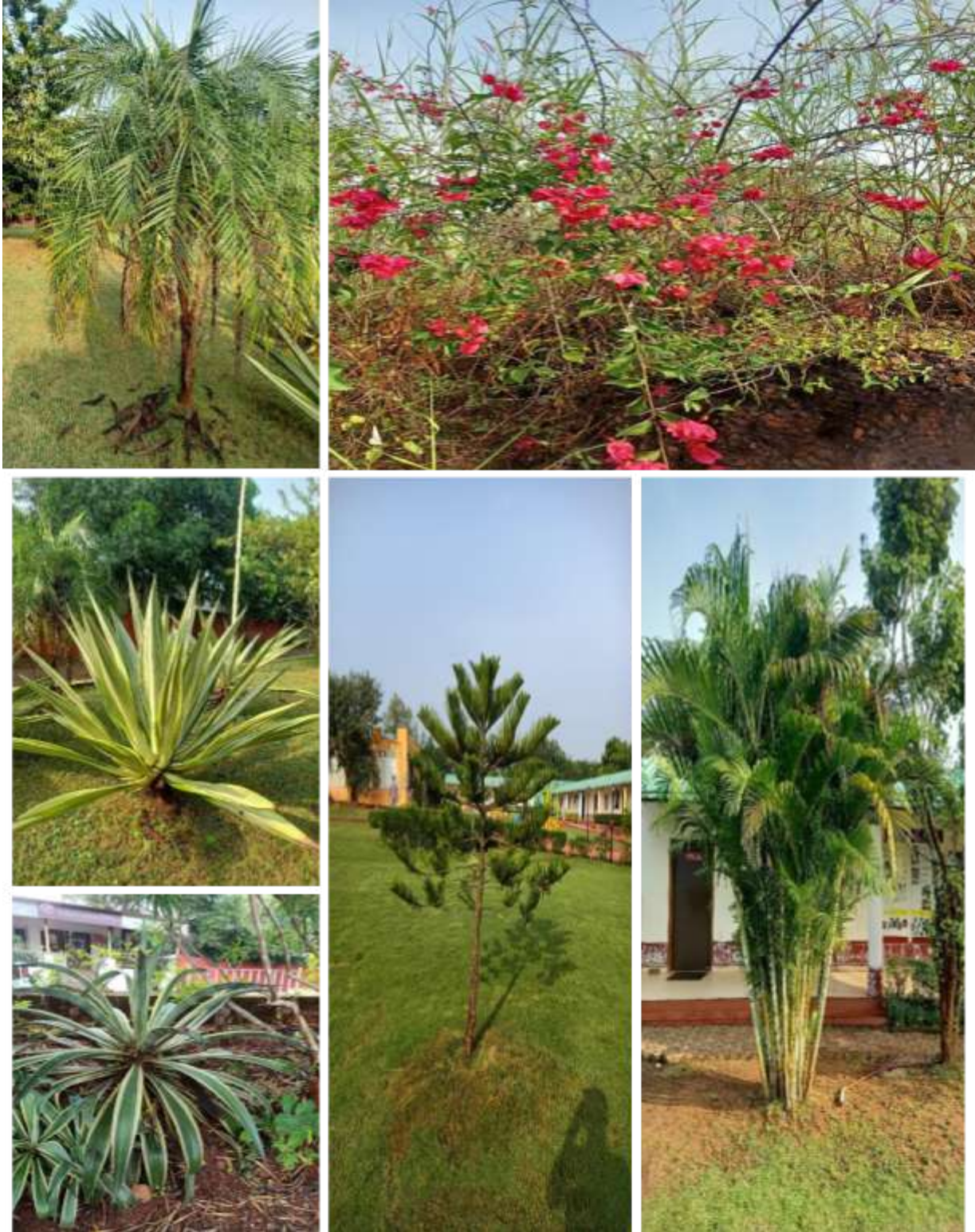
Plate 13. Water conscious plantation using drought tolerant species in SSU