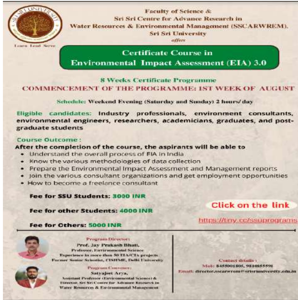
Plate 27. Certificate course by SSU