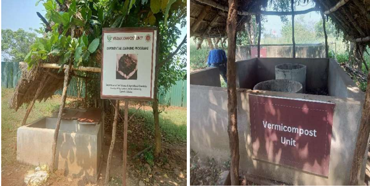
Plate 16. Vermicomposting as Experiential Learning Program for students