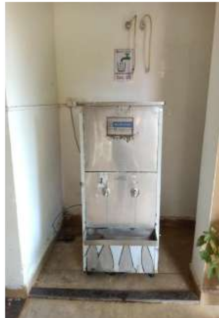
Plate 10. Free drinking water for all in SSU