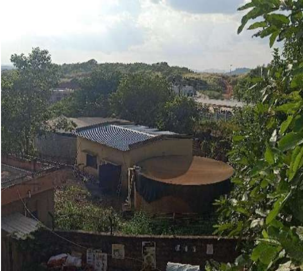
Plate 5. Aerial view of WTP in SSU

Through all these ways, we are bringing nature into higher education, water education, and every effort is made towards green infrastructure, living infrastructure, green campus, environment, and sustainability, and preventing water contamination.