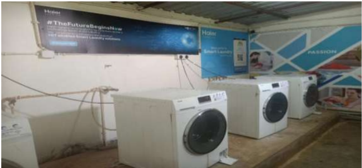
Plate 12: Water efficient appliances installed in SSU