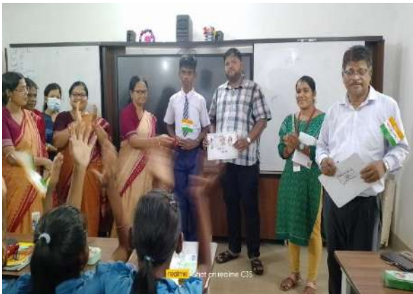
Plate 21. Awareness program for school children by SSU

The University is practicing the 5R concept (reduce, reuse, recover, recycle, replenish) that has helped in reducing the effects of water pollution and provided people with access to free and safe drinking water.