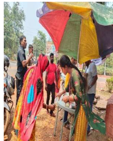
Plate 26. Free Drinking Water Camp by SSU