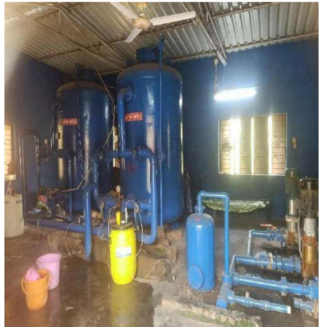
Plate 2. Water Treatment Plant in SSU