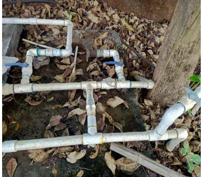
Plate 4. Water meter pipes to track consumption