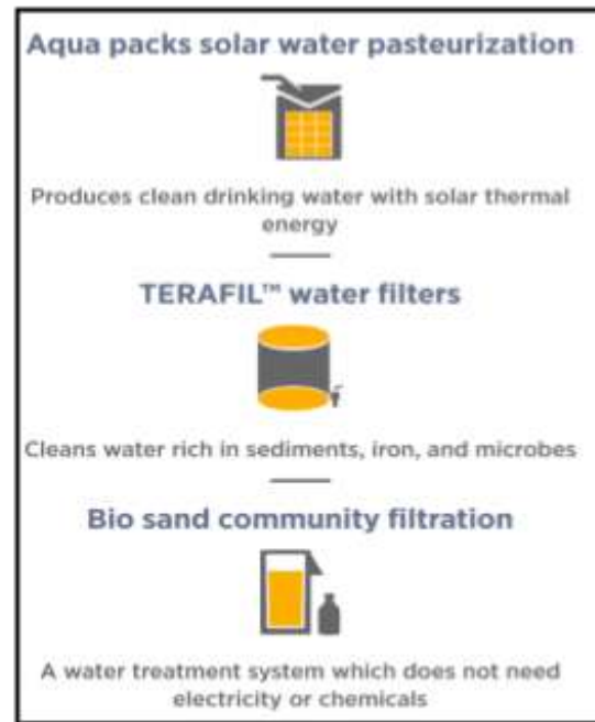
Plate 29. National Level Efforts for clean drinking water cum water security