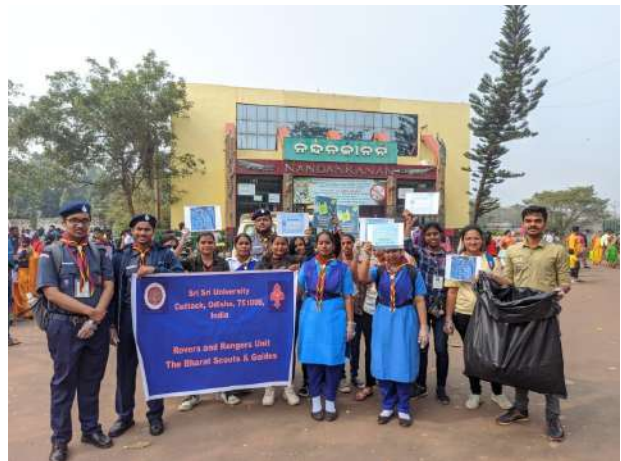
Plate 25. Ban on single use plastic, awareness and cleaning program organized by SSU at Nandankanan Zoological Park, Bhubaneswar