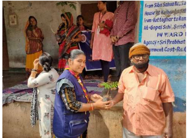
Plate 24. Farmers awareness and seedling program by SSU