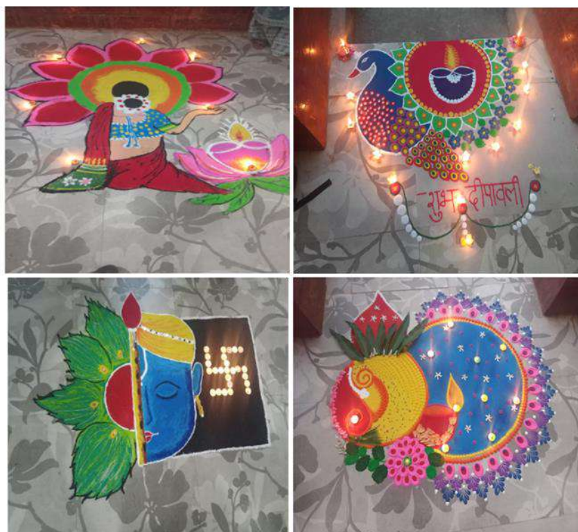
Figure 02: Students participating in Rangoli competition as a part of cultural events

Sri Sri University plans a number of events each year for the participation of Sri Sri University and other neighborhood institutions. One of the biggest cultural festivals in Odisha, our annual cultural festival Orion is ranked among the top 10 youth festivals in the state .