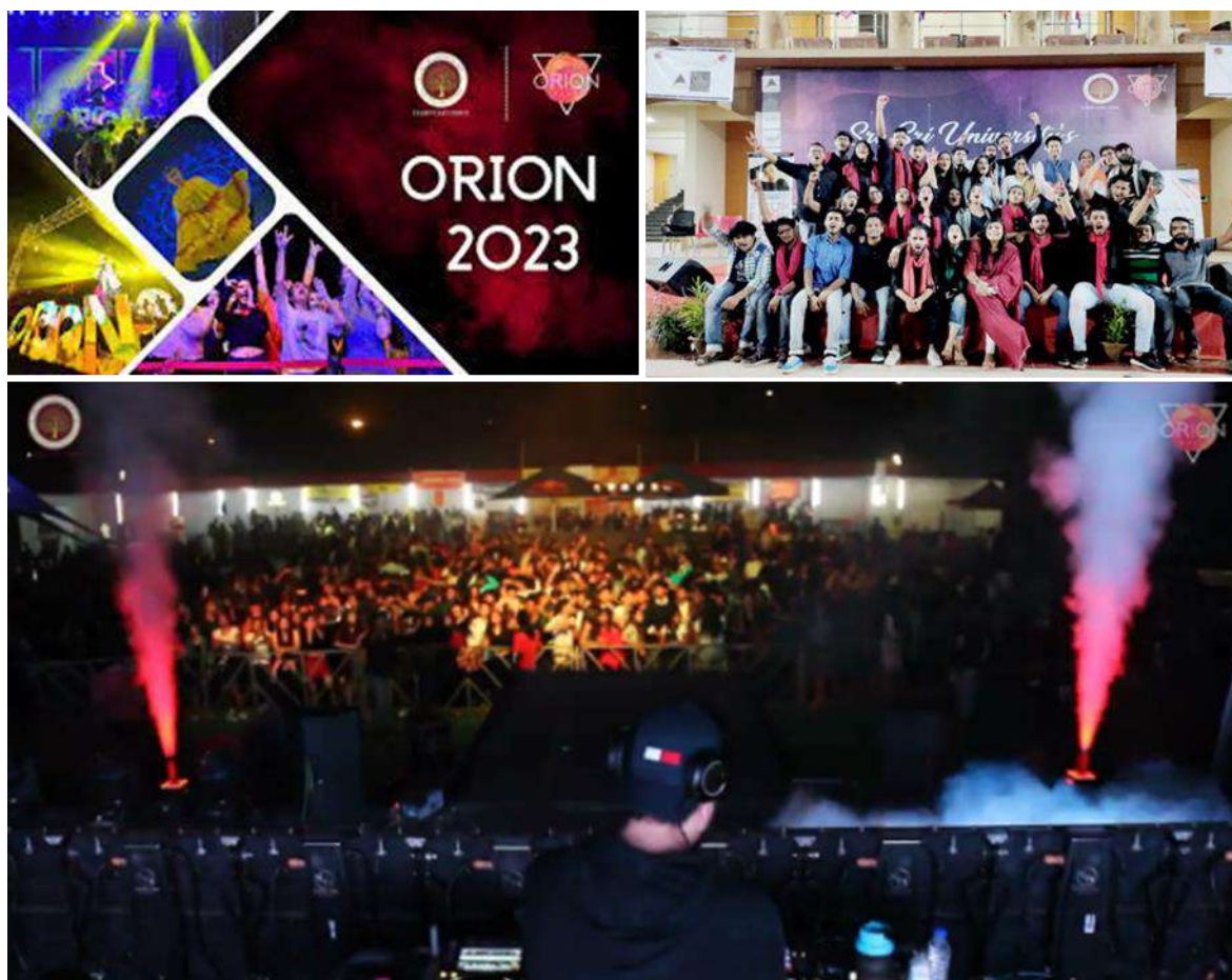
Figure 03: Celebration of Students' Annual Fest Orion

The Orion Fest team is made up of the core team, the design team, the web team, and the media cell. Participants in these come from a range of backgrounds, including academics, government officials, businesspeople, and others, including students.