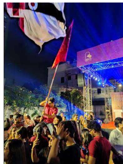
Figure 04: Students' participation at ZONASA at Amity University. Kolkata.

Sri Sri University showcase the talents and innovative ideas of the students thereby encouraging them towards displaying a diverse spectrum of artistic expressions. The students of Faculty of Architecture hosted an architectural models exhibition called "Pratibimb" - The Reflections of the Creative Mind" to showcase their works. This exhibition was not only for external visitors but also serves as an educational experience for the students themselves.