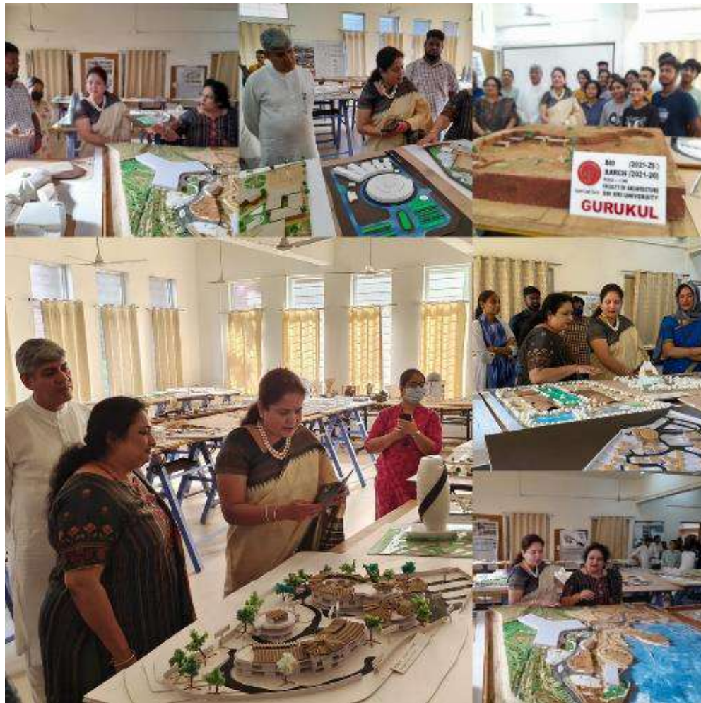
Figure 05: An Exhibition “Pratibimb - The Reflections of the Creative Mind” by the students of Faculty of Architecture to display their Models and Designs