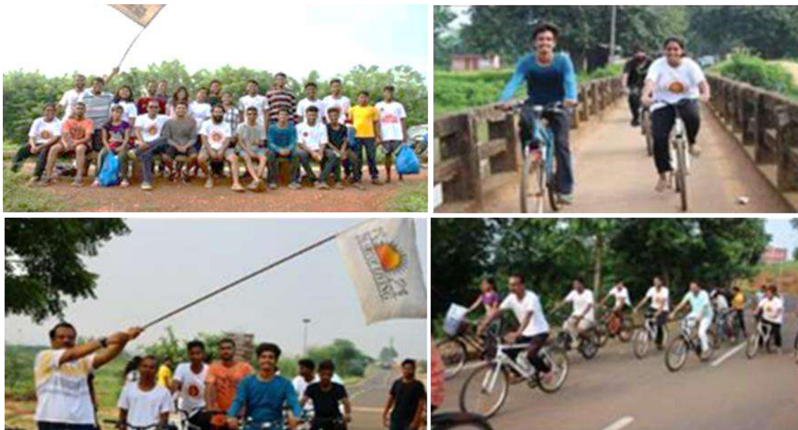
Figure 03: Promoting cycling on Sri Sri University campus

Every week, all of the staff and students who are staying on campus engage in a cycling rally to promote riding on campus for better health benefits and to adopt sustainable means of travel for short trips.