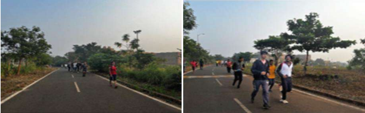
Figure 04: Development of sense of deep tranquillity through Sunday mornings walks on SSU campus