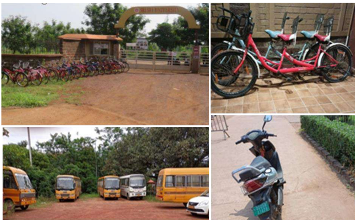
Figure 02: Sustainable transportation practices adopted at Sri Sri University

The movement of vehicles is reduced in the campus with the provision of Shuttle vans, cycles, battery bikes and buses for mass transportation. The following is the ratio of the number of vehicles to the population at the campus.