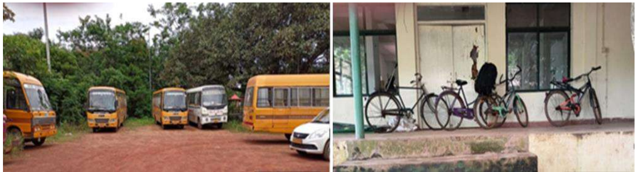
Figure 02: Parking area for Buses, Cars, Two wheelers and Staff bicycles

The above Route chart is for the Shuttle buses for staff and student. The time of pick up and pick points are mentioned. This facility promotes use of less private vehicles.