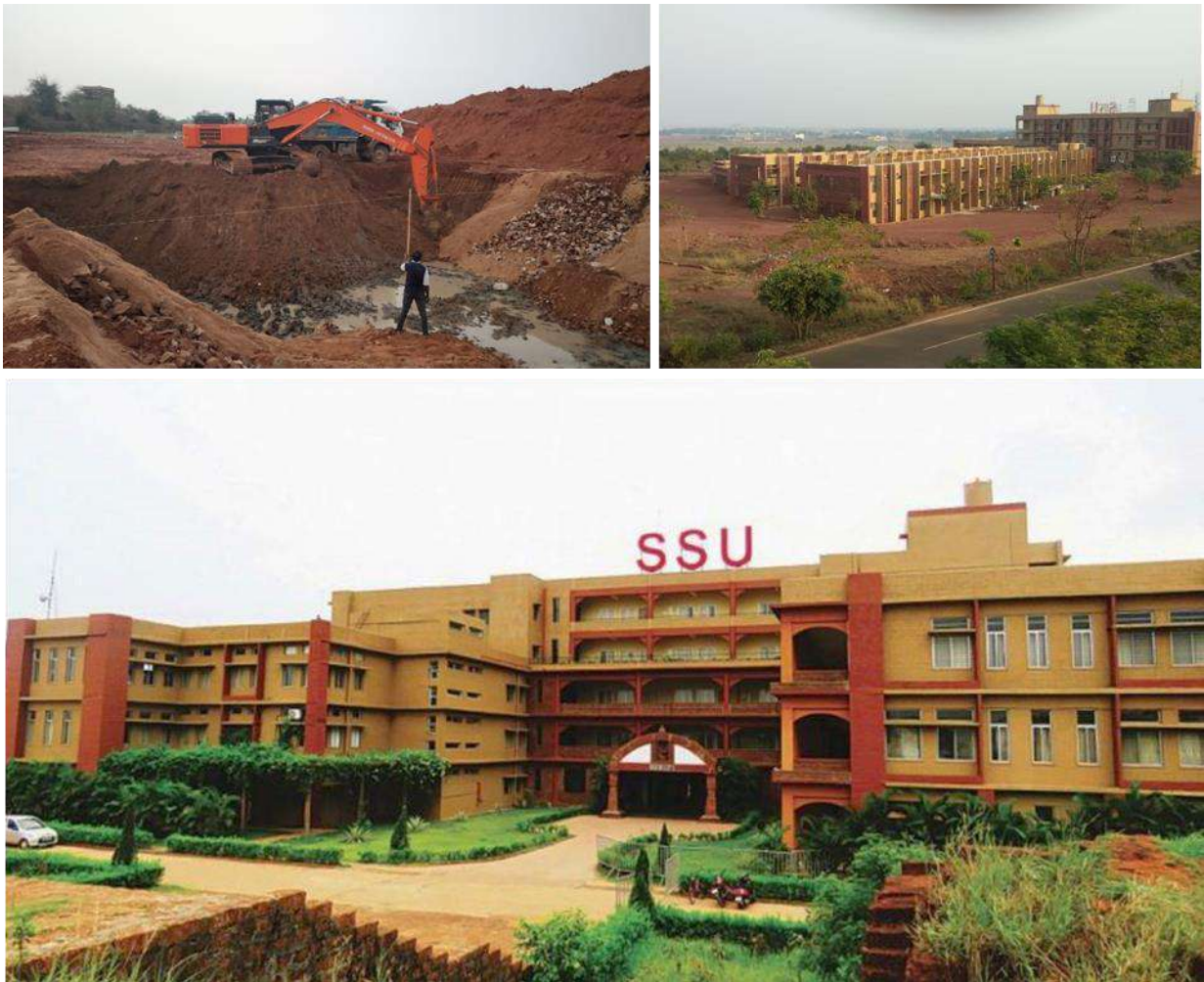
Figure 02: Academic Blocks 'Shruti' and "Kirti"