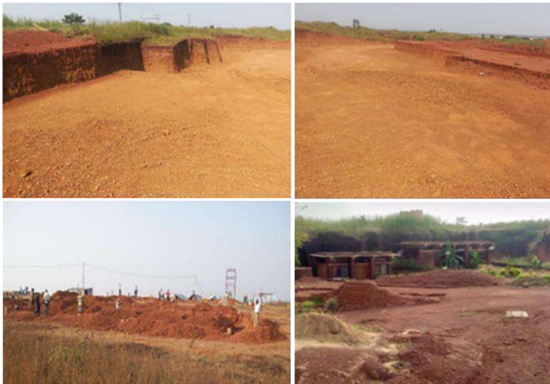
Figure 01: Vast quarry land before the beginning of construction work

A decade ago, the Sri Sri University was a rocky, desolate area; today, it is a verdant haven. With 188 acres of quarry land, it is a spectacular, expansive campus with both residential and non-residential amenities. The university, which occupies a former quarry, is designed as a collection of simple buildings surrounded by bushes, trees, and perfectly manicured lawns that provide a calm atmosphere. In keeping with the university's theme, "an ecologically sensitive green campus," every building structure has been thoughtfully placed in the low-lying quarry area to prevent additional site damage.