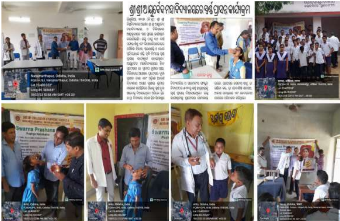
Plate 6. Swarna prashana camp at OAV Ramdaspur