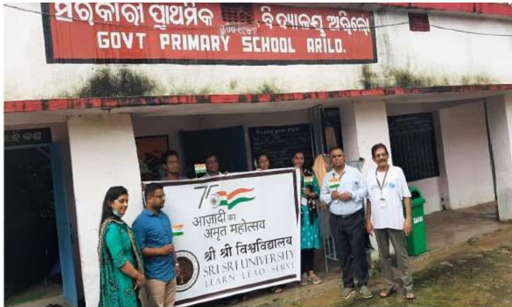
Plate 9. For a Govt. program SSU Faculty and students were distributed the National flags at Govt.Primary School, Arilo.