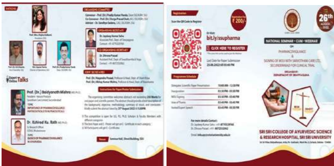
Plate 12. National Seminar cum Webinar on Pharmacovigilance (26 th August 2022)