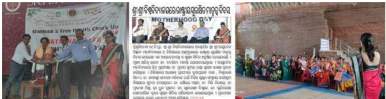
Plate 17. Seminar and Free Health Camp National safe Motherhood Day (11 th April 2023)

Health camp organized by Sri Sri College of Ayurvedic Science and Research Hospital, SSU at Banki and more than 250 patients were get benefited in this camp (Plate 16).