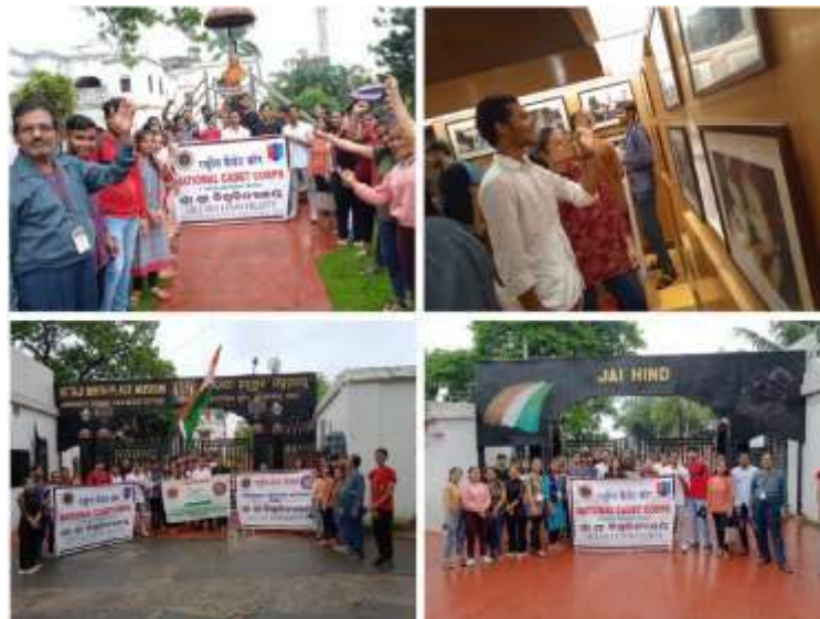
Plate 10. Awareness program of rally for Unity, conducted by SSU Staffs and Students at Odia bazar, Cuttack.