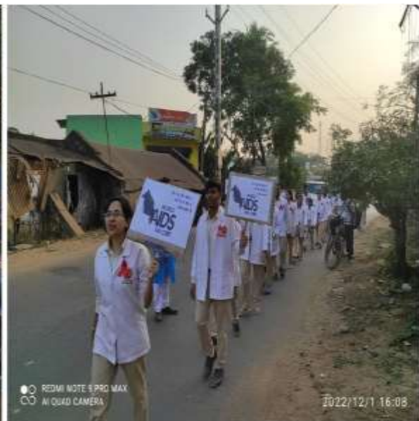
Plate 14. Rally on World AIDS day at Cuttack (1 st Dec.2022)