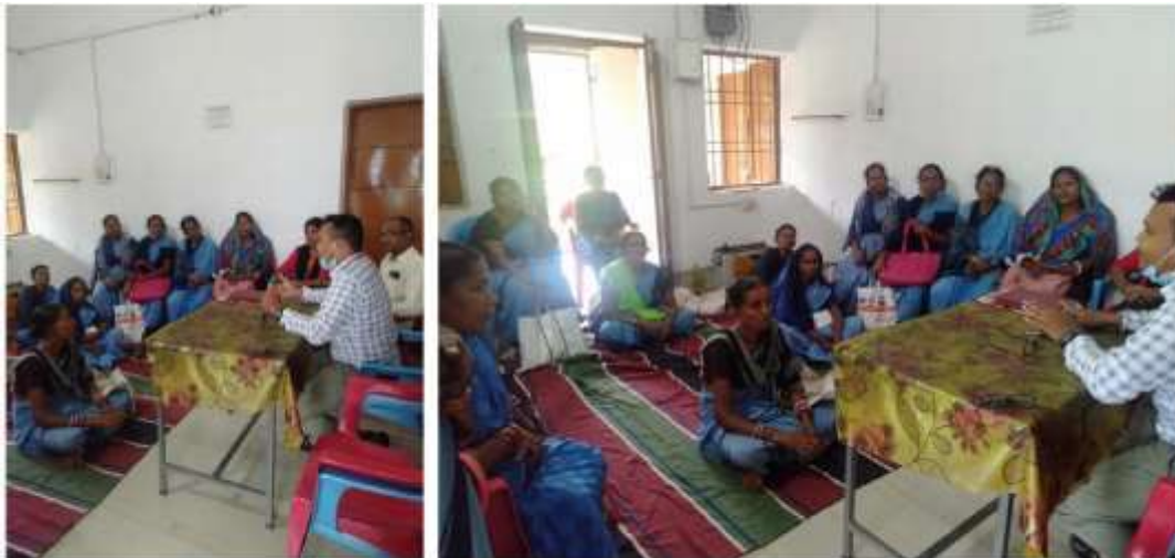
Plate 7. Health Camp at L&T training Institute (22th July 2022)

Mundali range Asha employees were educated at PHC, Mundali about Gynic deptt. of ssuayh along with all other hospital facilities.