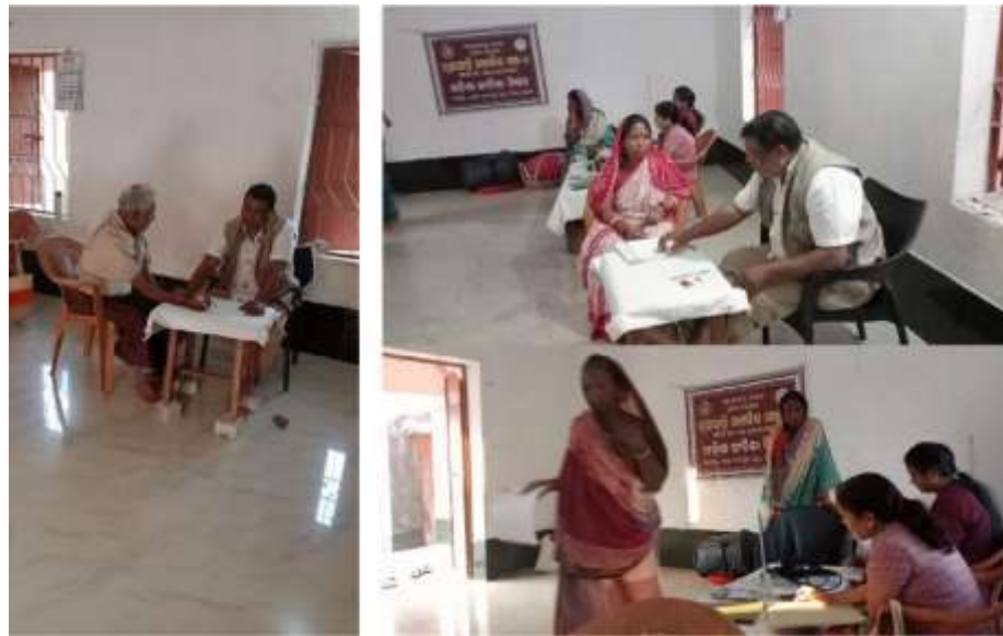
Plate 15. Nadi pariksha Camp by SSCASRH Doctors (16 th Dec.2022)

A rally was conducted by students and staffs of SSCASRH, SSU on the eve of World AIDS Day and awareness to the common people with various slogans, Cuttack.