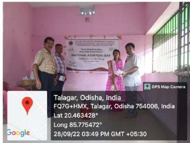
Plate 13. Outreach program at Talagar, Cuttack (28 th Sept.2022). Awareness program on the eve of National Ayurveda Day regarding Health and Diet at Talagar, Cuttack. by SSCASRH , SSU staff,