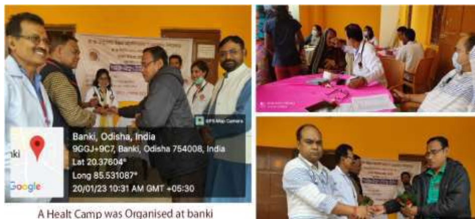
A Healt Camp was Organised at banki

Nadi Camp was conducted by Sri Sri Ayurved Hospital, SSU at Nuasahi, Banara and total 12 number of patients were treated.