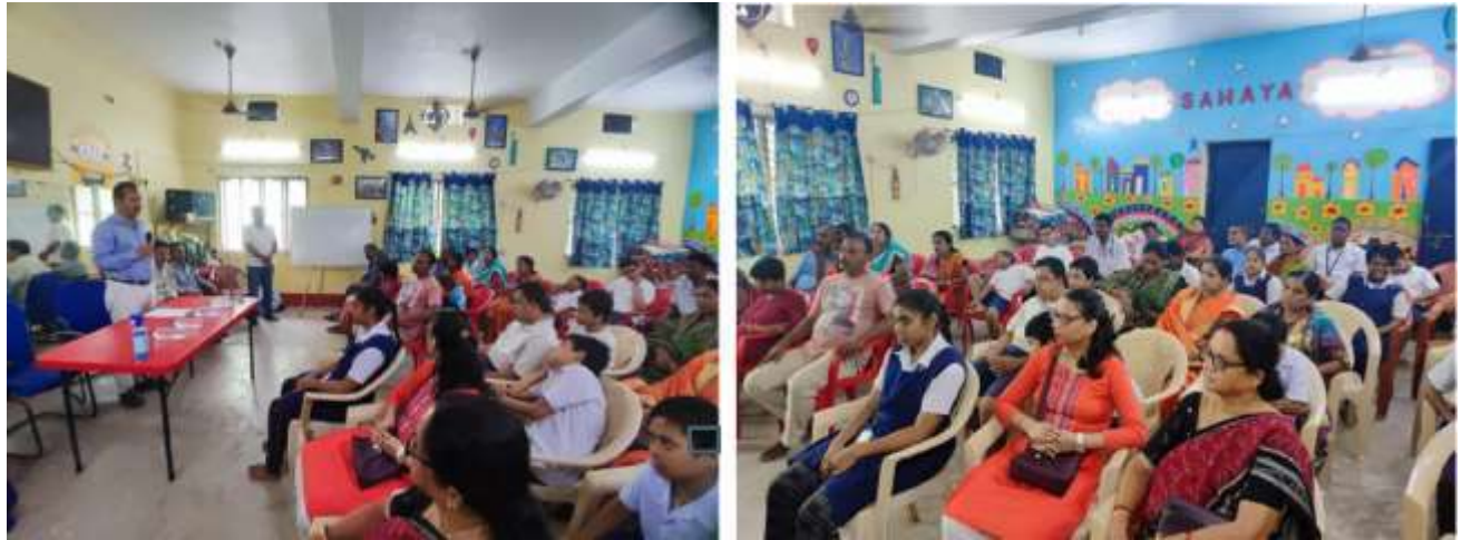
Plate 5. Health Awareness Program