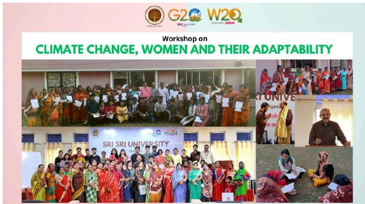
Plate 15. Local village women made aware of climate change, water usage, and agriculture