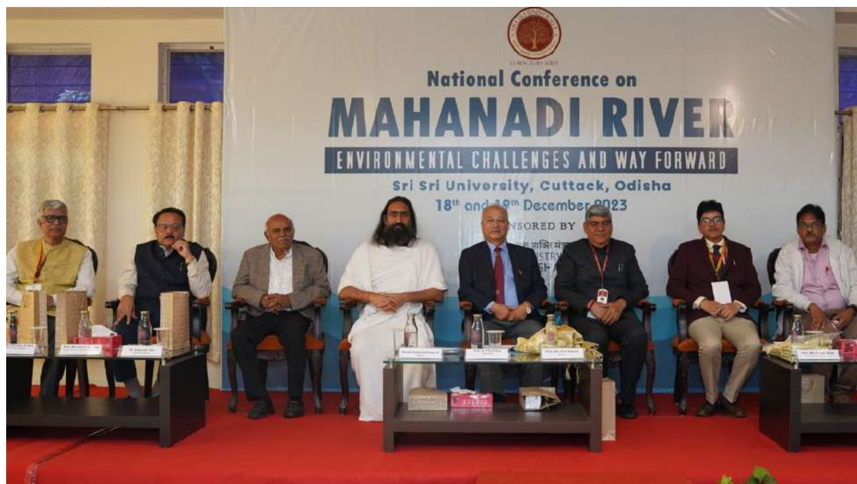
Plate 1. National Conference on Mahanadi; Environmental Challenges and Way Forward

This holistic integration of academic excellence, practical application, and community engagement positions Sri Sri University as a model institution for environmental education and sustainable development. By preparing environmentally conscious professionals while simultaneously addressing immediate community needs, the university exemplifies how higher education can be a powerful catalyst for positive environmental change and community empowerment.