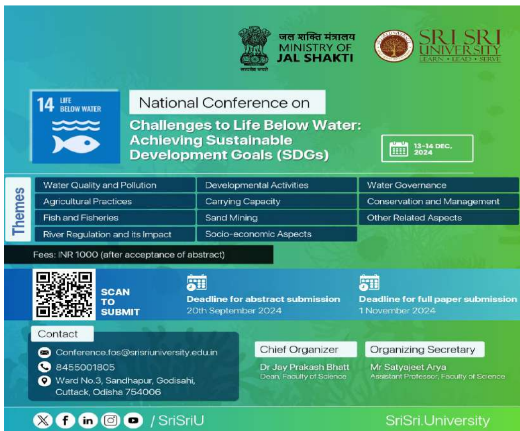
Plate 6. Our upcoming national conference with a special theme on Life Below Water

Sri Sri University's commitment to environmental stewardship extends deeply into marine conservation and community engagement. The institution has developed a comprehensive approach to environmental awareness , particularly focusing on sustainable fishing practices and coastal ecosystem preservation . Through carefully designed programs, students are encouraged to engage directly with local fishing communities, creating meaningful dialogues that bridge academic knowledge with real-world practices.