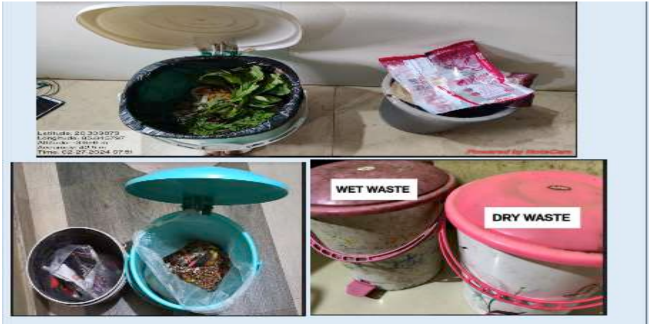
Plate 5. Safe waste disposal programme