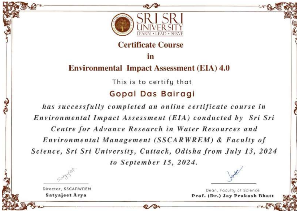
Plate 3. Educational Program on Environmental Impact Assessment