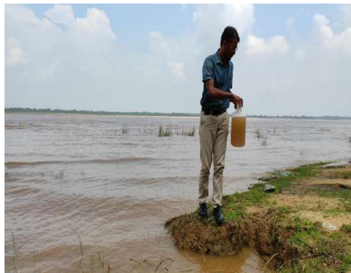
Plate 14. Students collect samples from the canal for water quality analysis