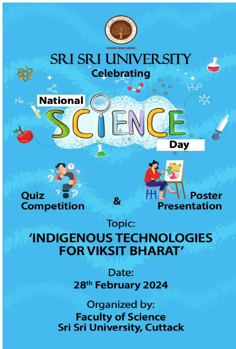
Plate 5. Celebration of National Science Day