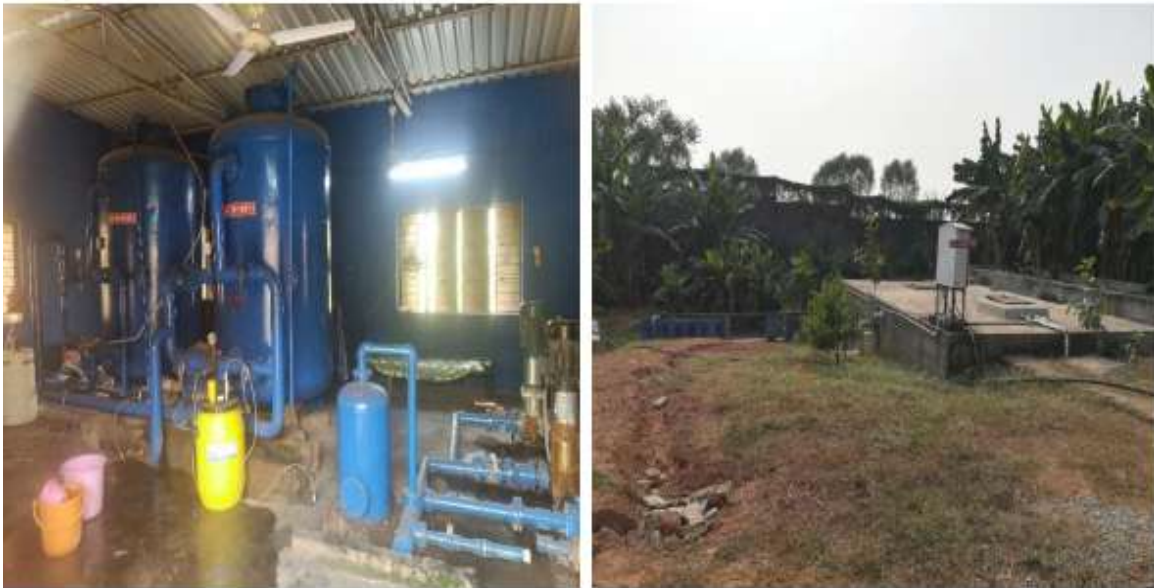
Plate 11,12&13. Adjacent wetland and water treatment infrastructure at Sri Sri University