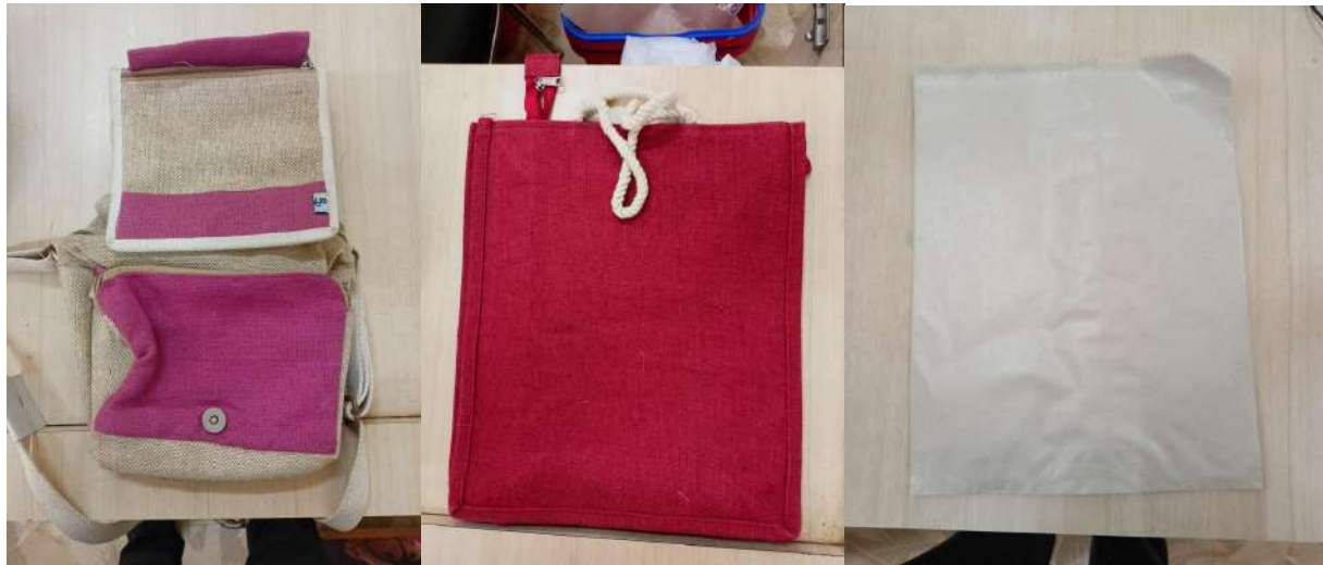
Plate 8,9&10 Alternate materials of plastic like Jute Bags and paper bags are used inside the campus.