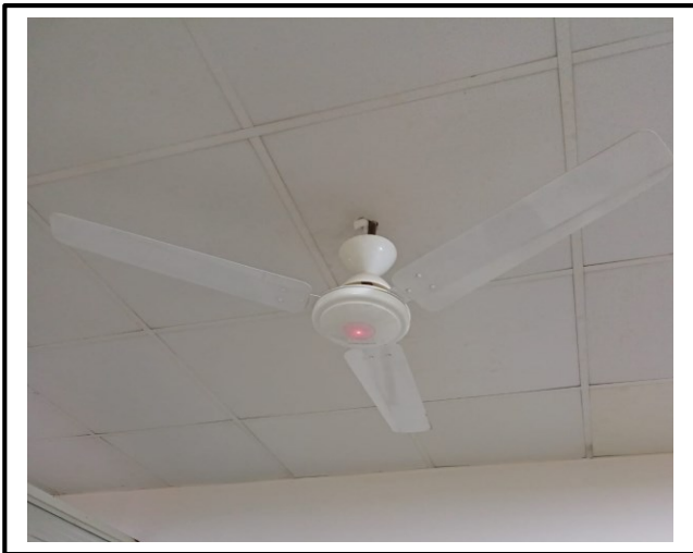
Plate 7.2.2.a. BLDC ceiling fan

Currently, the university has made it a paramount objective to align with national energy conservation policies. As part of this commitment, the institution systematically replaces non-compliant equipment on an annual basis. The relevant energy efficiency standards are subject to periodic review and adjustment, contingent upon the availability of additional funding. This proactive approach reflects the university's dedication to staying in harmony with national energy conservation initiatives and ensuring a sustainable and environmentally responsible campus environment.