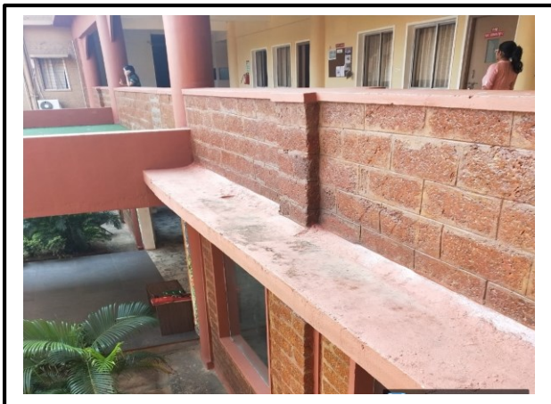
Plate 7.2.2.c. laterite stone building