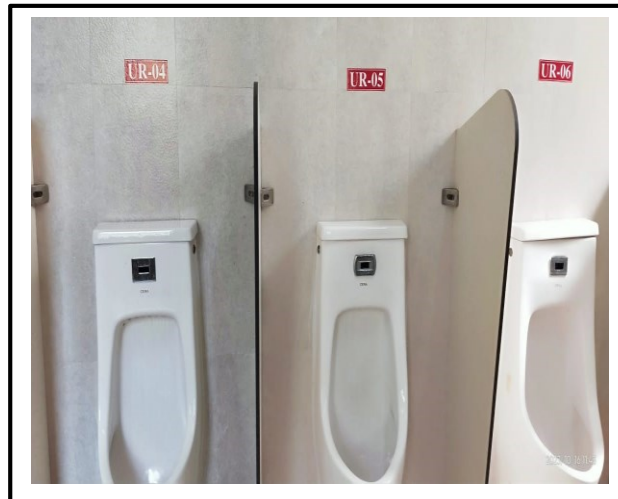
Plate 7.2.2.g Sensor based urinary system

Description: Sri Sri University (SSU) hosts an annual conference focused on energy conservation and carbon reduction to evaluate plans for the replacement of existing equipment with energy-efficient alternatives in the forthcoming year. Each year, a specific budget is earmarked for the replacement of energy-intensive equipment, with the objective of realizing an annual improvement in overall energy efficiency by no less than 10%. This proactive approach reflects SSU's unwavering commitment to sustainability and its dedication to fostering an environmentally responsible campus.