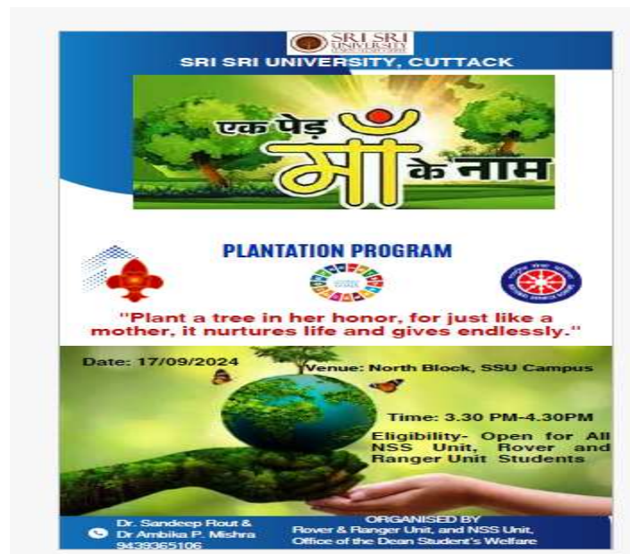
Plate 2. Environment and Climate awareness, Plantation activity by Rover and Ranger Unit and NSS Unit of University