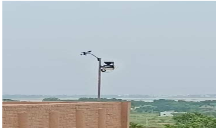
Plate 9. Automatic weather recorder installed at University for daily weather data and Meteorology and Climate Science courses were included in B.Sc. Agriculture and B.Sc. Horticulture Program