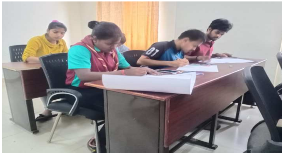
Plate 8. Drawing competition on the eve of World Forest Day Organised by the Rover and Ranger unit of the University.