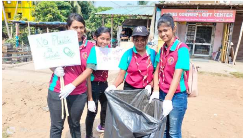
Plate 6- Plastic Awareness and Cleaning activity at Trisulia Market, Cuttack