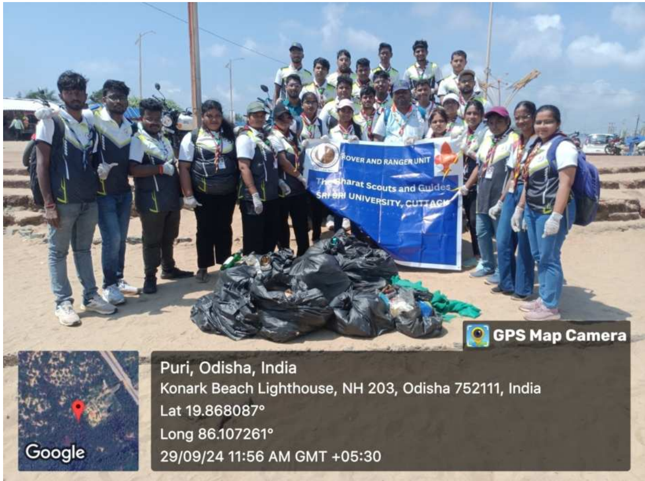
Plate 4. Awareness cum cleaning activity for Single use plastic at Konark Beach, Puri, Odisha