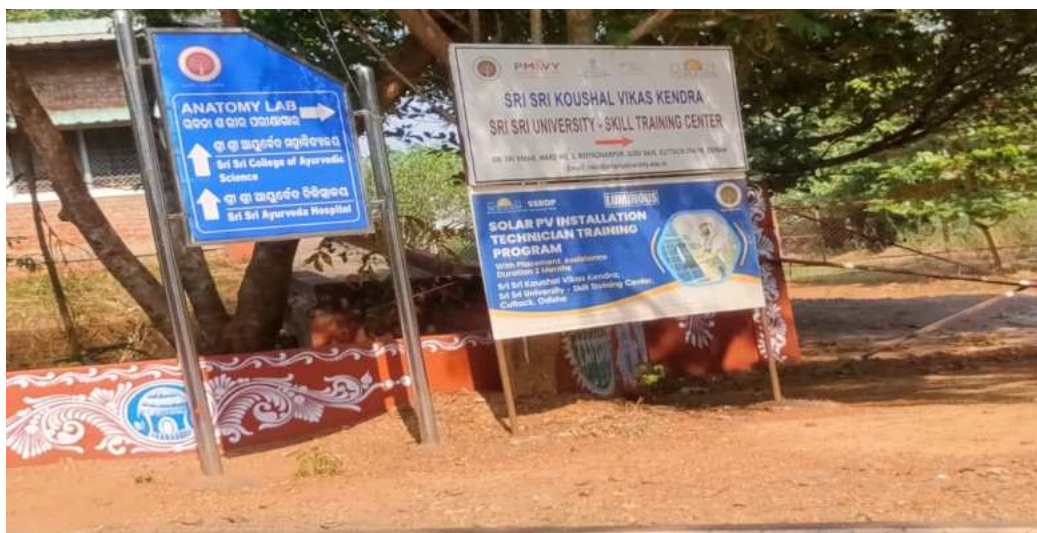
Plate 14. Solar Electrician training centre