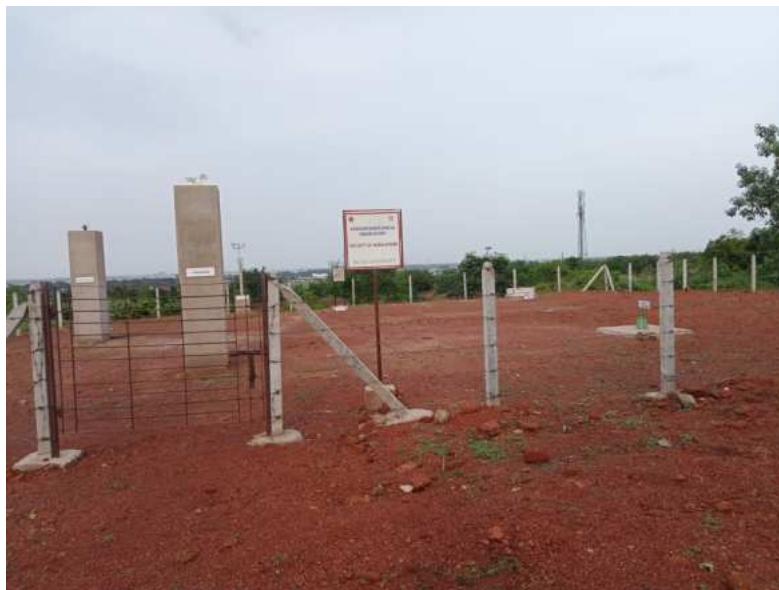
Plate 10. Agro-Meteorology Observatory at the University maintained by Faculty of Agriculture for the weather data and practical application to course program.