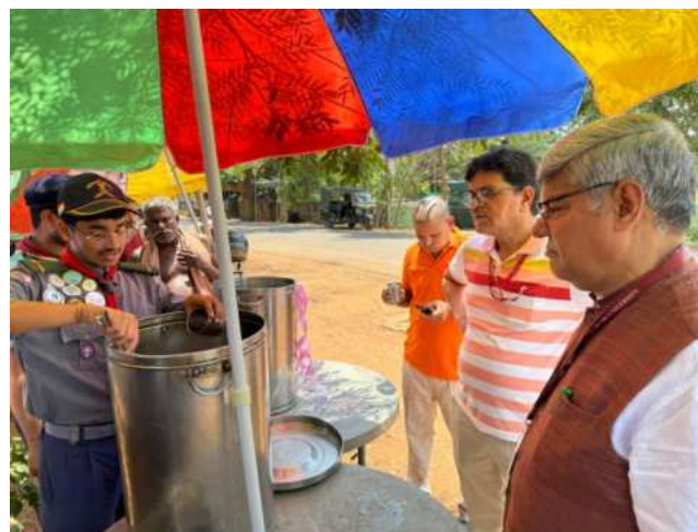
Plate 3. Summer Service camp for Heat Stroke, Climate awareness