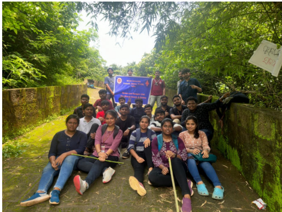
Plate 1. Nature study trip on Climate change education and nature trail by University Students at Barunei hill, Khordha

Provide local education programmes or campaigns on climate change risks, impacts, mitigation, adaptation, impact reduction and early warning