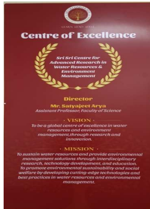
Plates 11. Centres dedicated to climate, sustainability and water studies