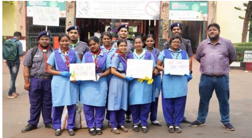
Plate 5. Plastic awareness at for enviroment proection by Rover and Ranger Unit at Nandankanan Zoological Park