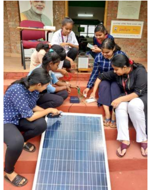
Plate 12.Solar Technician & Assistant Electrician training Plate 13.Solar PV installer training