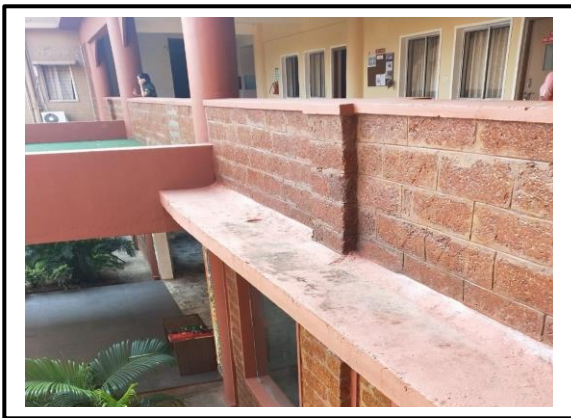
Plate 7.2.2.c. laterite stone building