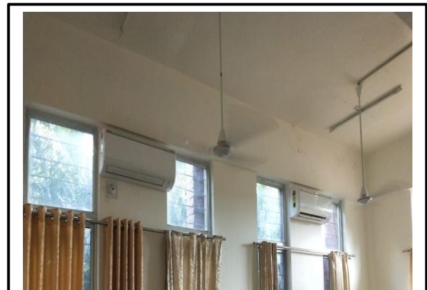
Plate 7.2.2.d. Naturally ventilated staff room