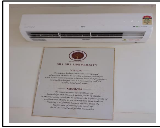
Plate 7.2.2. e. All CFL lamp replaced with LED bulb. Plate 7.2.2.f. A/C with ISEER>4.5