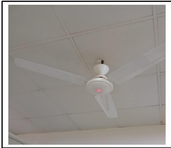
Plate 7.2.2.a. BLDC ceiling fan

Have plans to upgrade existing buildings to higher energy efficiency