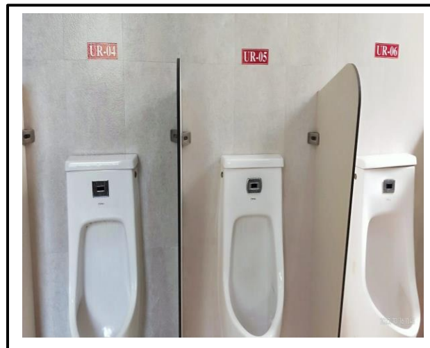
Plate 7.2.2.g Sensor based urinary system